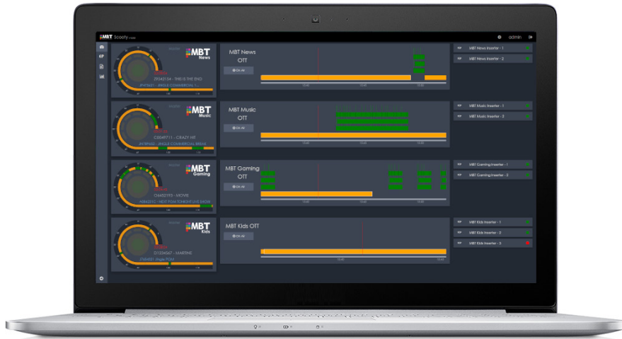
Interface web Scooty pour l'administration et la surveillance.

The solution for marking broadcast signals, compatible with many brands of insertion systems.